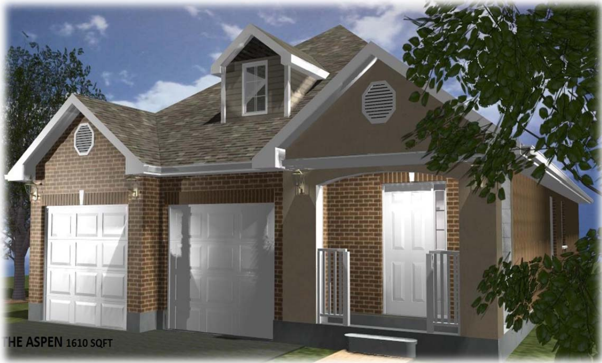
THE ASPEN 1610 SQFT